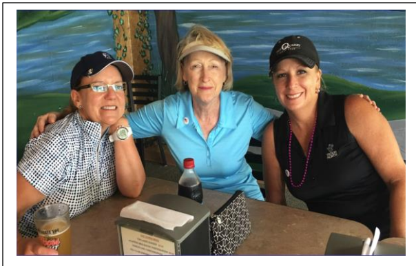
Is that a "Hidden Lake" in the background??