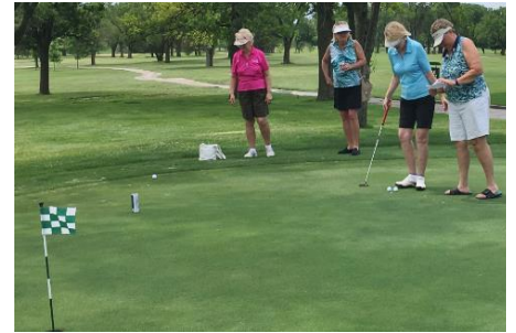
Putting contest play – each golfer got 2 attempts – plus 1 extra per immediate family member who has served our country in one of the armed forces! I think Becky and Becke tied for having the most family members in the Armed Services with 4 each.