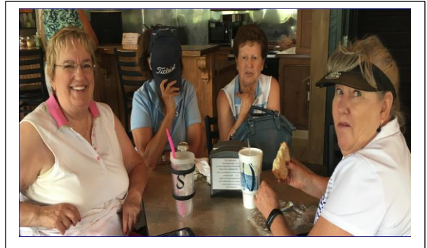
Eating and relaxing time for all after a hard day at the golf course!!

Hope to see everyone in Wellington for next month's tournament!!