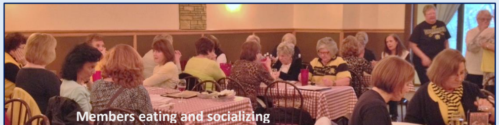
Members eating and socializing