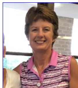
Lana Lyda Tournaments