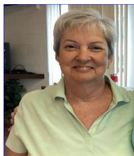
Peggy King Handicap