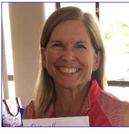
Carol Shelton Annual Awards