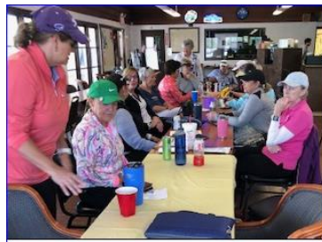
Everyone had a good time