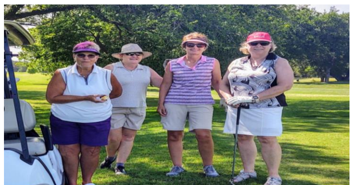
Pics from Sim Tournament