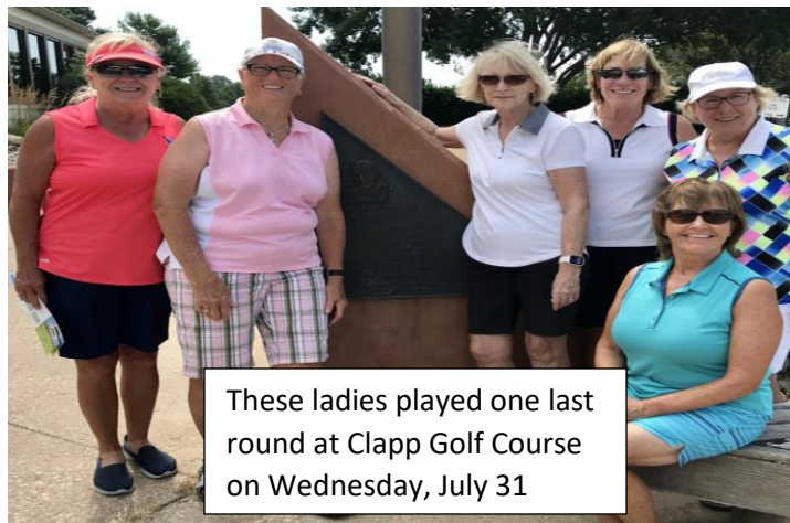
These ladies played one last round at Clapp Golf Course on Wednesday, July 31