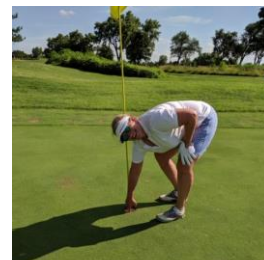
# 12 at MacDonald