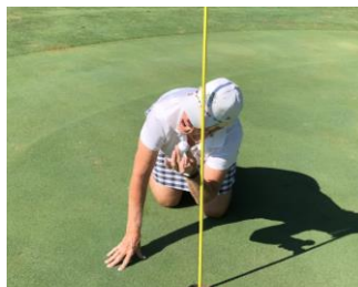
# 17 at MacDonald