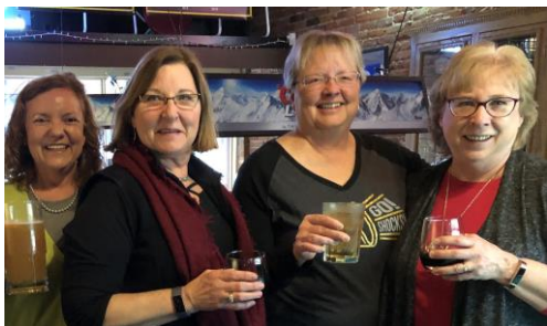
THE OFFICERS AND THE CHAIRPERSONS